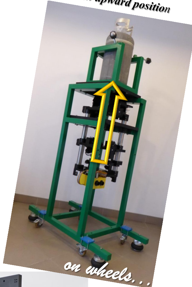
L-FE holocamera: in upward position