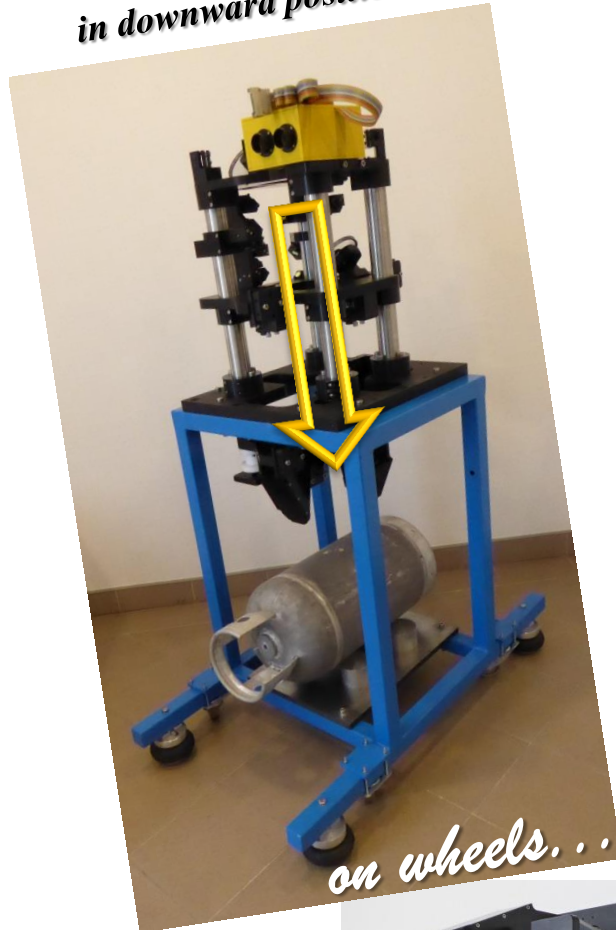
L-FE holocamera: in downward position